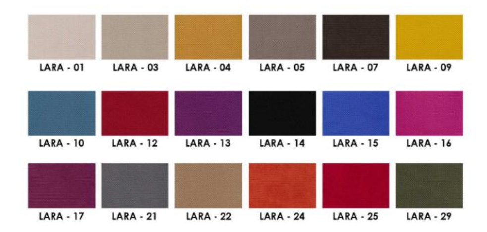
Elegant Fabric Selection For Aluminium Banquet Chairs

Classic Fabric Selection For Aluminium Banquet Chairs